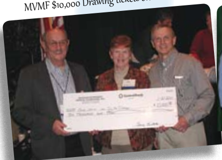
MVMF $10,000 Drawing tickets on sale now.