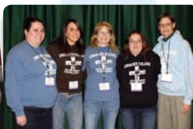
Crowder College - 2011 Academia Bowl winners!